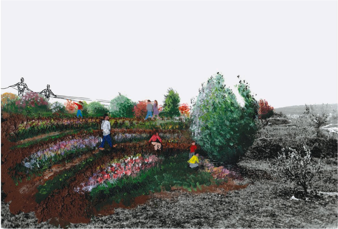
Proposal for public gardens in Mirijevo Terrain Vague.