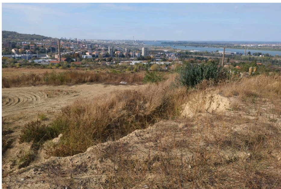
View toward Belgrade from Orlovica Breg.

The gentle slopes of the Šumadijan Upland form a bowl around the east side of Belgrade's central area. At their summit, the cemetery in the Lešće neighbourhood overlooks the sprawling villages to the south and the confluence of the Sava and Danube Rivers with the broad Pannonian Basin in the north. Formerly an agricultural and pastoral area in the vicinity of the city, settlements and industry have encroached upon the eastern hills, turning the farmland into pockets of unused grasslands.